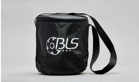
C43 – Washable bag with shoulder belt.