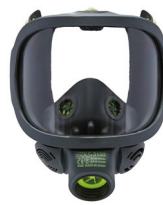
Full face masks BLS 3000