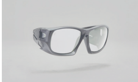
C22 – Frame for prescription lenses.