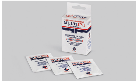
Q530 – Multi-purpose disinfectant wipes.