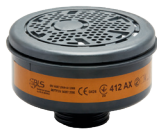
Filters BLS 400 series