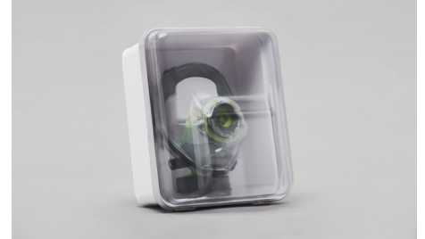
C90 – Wall mounted container.