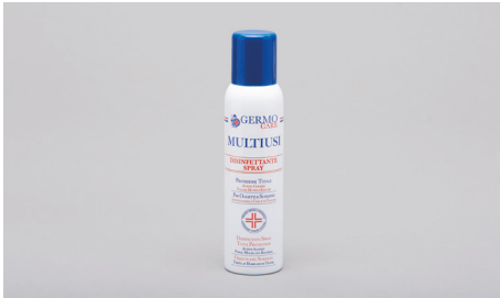
Q409 – 150ml disinfectant spray bottle.