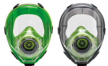
Full face masks BLS 5400 - BLS 5150