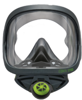
Full face masks BLS 2150 - BLS 2150V